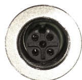
SHIPCO LEVEL TRANSMITTER 4–20mA M12 ROUND MALE CONNECTOR